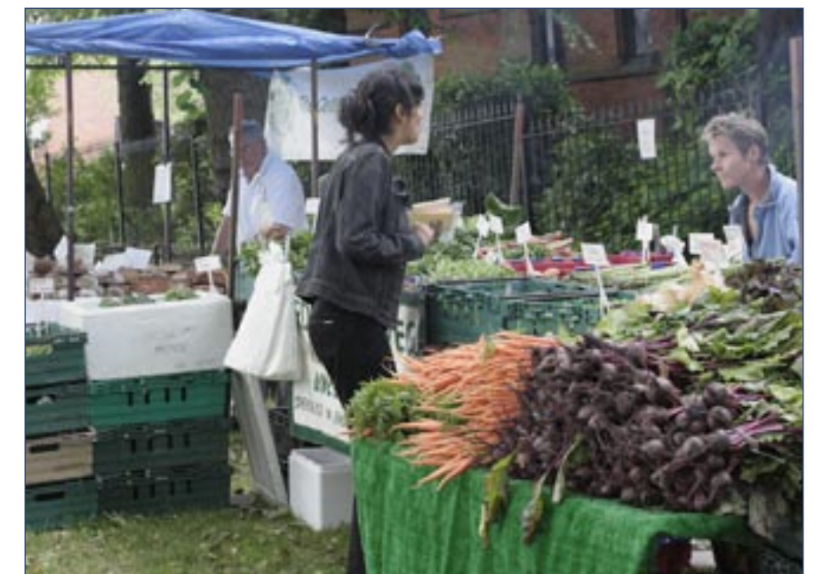
By Grievous Angel

Take the example of biofuels. If we decided on our community farm to turn some of our land over to the production of oil-seed rape for fuel rather than using it as grazing land for our cattle we would be able to drive but not eat meat. This sort of trade-off is popular amongst economists in theory, but in reality it's a trade-off they rarely have to make. An investor's decisions to put money into