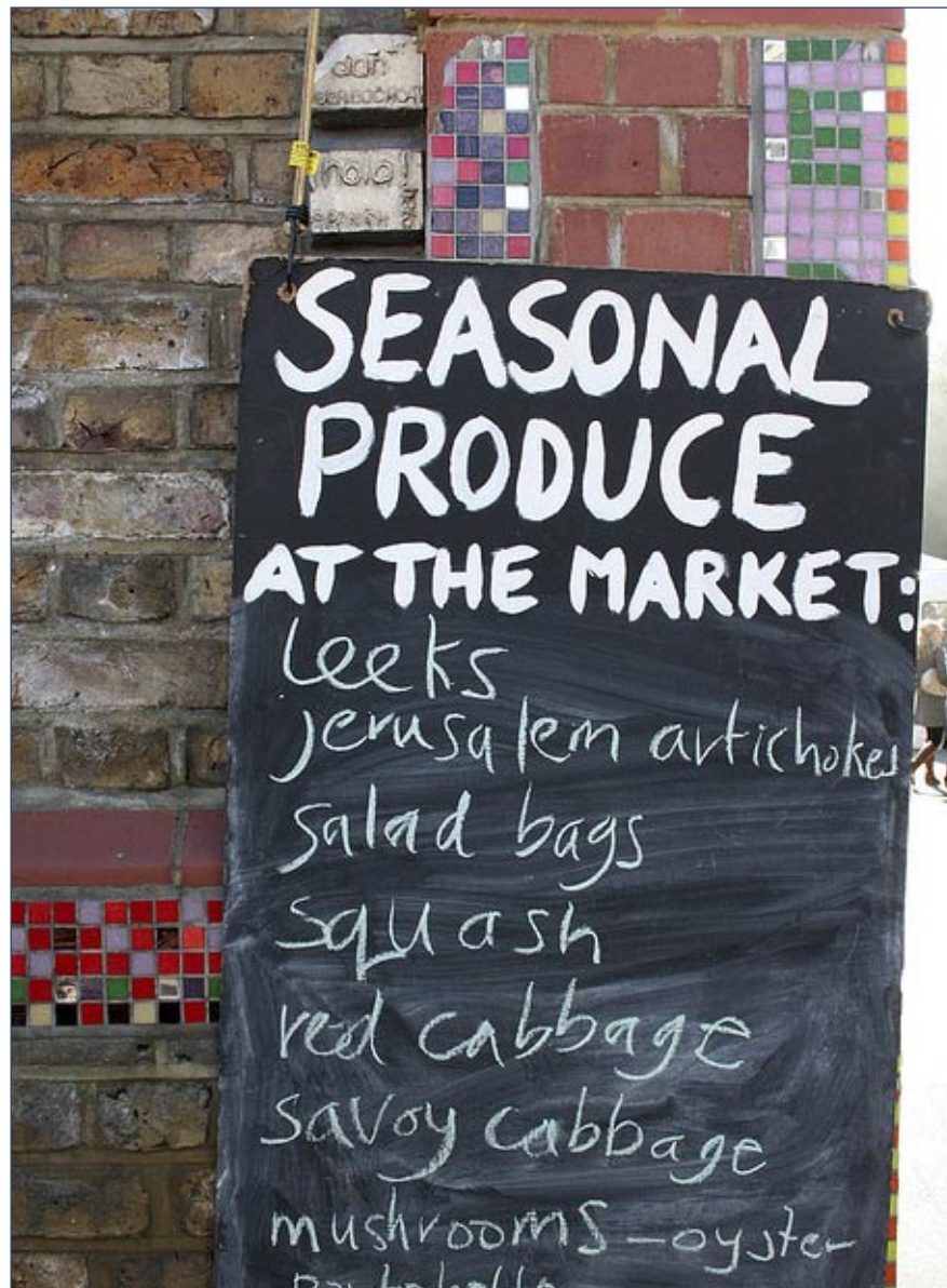
By Scott Roberts

For anyone who want to get to grips with the science behind climate change. A little book packed full of facts and figures, written in an accessible tone, and tackling the politics, history and potential solutions. Danny Chivers is obviously dedicated to persuading people of the imminent dangers of climate change, but I fear he will only be preaching to the converted in this book. EB