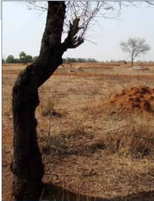
India: Tree and soil