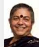
Vandana Shiva is a world-renowned environmental leader and thinker. Director of the Research Foundation on Science, Technology, and Ecology, she is the author of many books, including Soil not Oil (2009). She is the founder of Navdanya ('nine seeds'), a movement promoting diversity and use of native seeds. Before becoming an activist, Shiva was one of India's leading physicists. She holds a master's degree in the philosophy of science and a Ph.D. in particle physics.

One of the problems with the climate negotiations is that they are based on the false assumption that development can only be based on fossil fuels, and hence on pollution. By default, countries are then pitted against each other in a contest based on the 'right to pollute'. However we can improve human welfare while reducing fossil fuel use and greenhouse gas emissions.