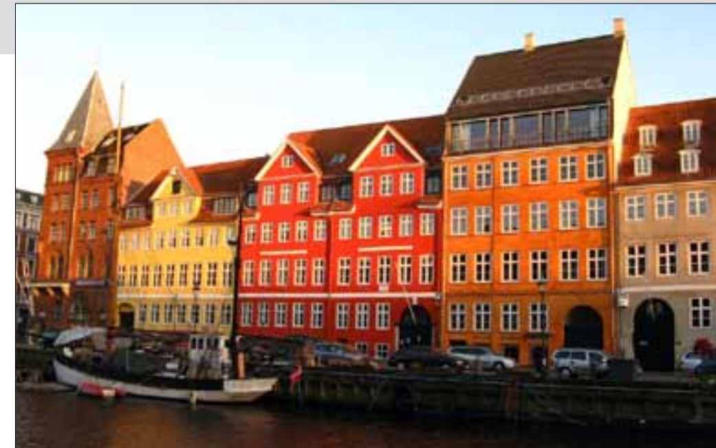
All hopes rest on Copenhagen NIOS

Within a year of the UNFCCC coming into force the IPCC released its second report. This updated assessment made it clear that more ambitious action was needed to tackle climate