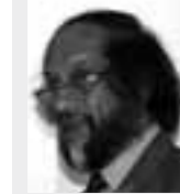
Dr Rajendra K. Pachauri has been chairman of the Intergovernmental Panel on Climate Change (IPCC) since 2002. He is also director general of TERI, the Energy & Resources Institute, in New Delhi, India.

We want the potential of women's role in tackling climate change to come to the fore, be properly funded and to see more women at the debating table as a result.