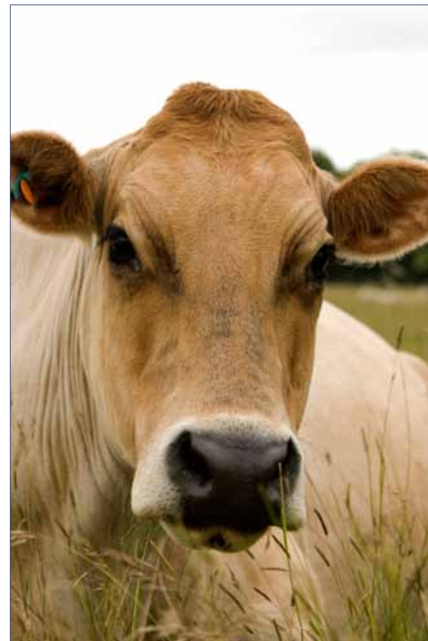
A jersey cow.

We are, of course, a long way off rationing - or even fiscal measures to encour-