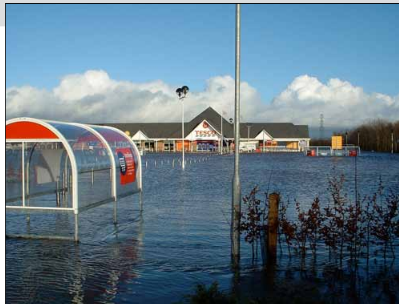
A Tesco store flooded after heavy rains.

Climate change, and society's response to it, will fundamentally alter the competitive context within which companies operate