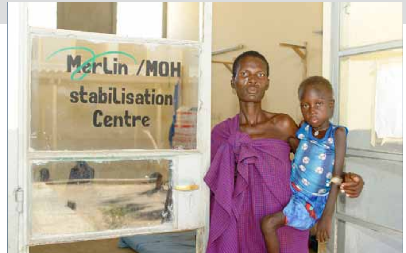
Feeding station in Kenya

Even without climate change, food prices will rise - driven by population and income growth and biofuels demand - but climate change exacerbates the extent of the increase. Prices will climb for the world's staple crops. Without climate change, 2050 wheat prices increase by almost 40 percent; climate change adds an additional 90 percent. Rice is projected to increase 60 percent without climate change and an additional 12 to 14 percent with climate change. 2050 maize prices are